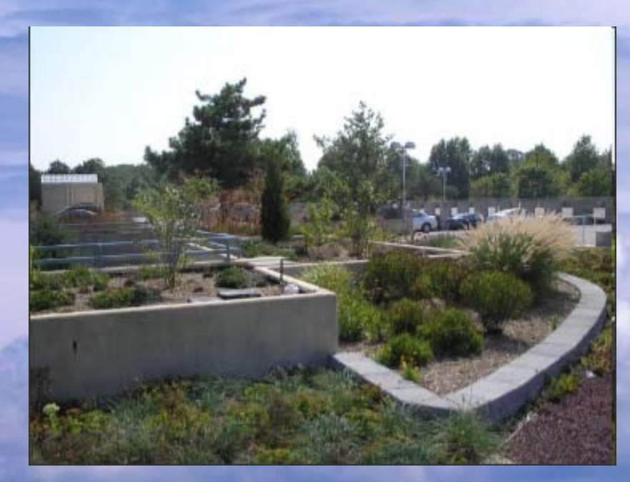
Green roof: Herrity parking structure

Building green County buildings and passing Green Building Ordinance