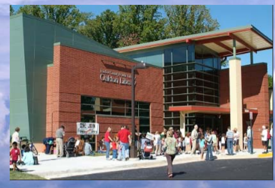
Green building: Oakton Library