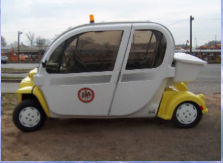
Priuses and electric vehicles