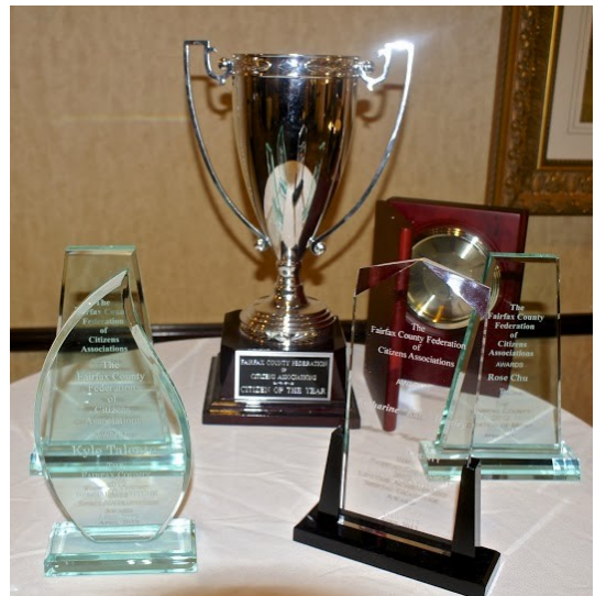
Clockwise from left: Special Gratitude Award, Citation of Merit, Federation Cup for Citizen of the Year, Citizen of the Year Clock for 2011 honoree, Citation of Merit, and Lifetime Achievement Award

More banquet pictures will be posted on the Federation's web-site at www.fairfaxfederation.org and on Facebook at Fairfax Federation. Thank you for making the Sixty-Third Citizen of the Year Banquet a very special evening for our honorees.