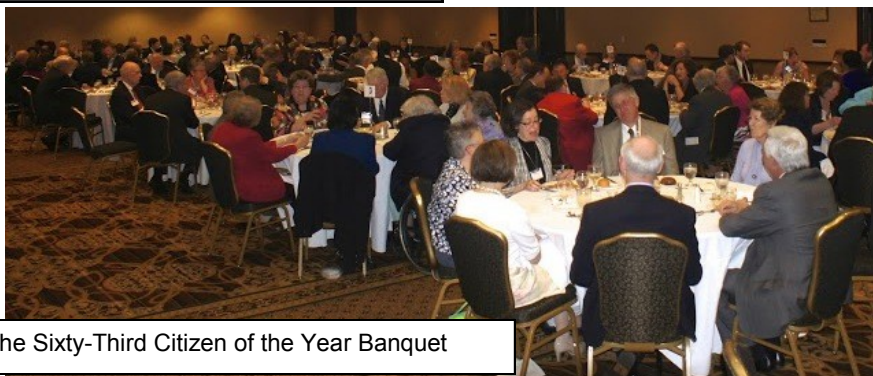
Guests at the Sixty-Third Citizen of the Year Banquet